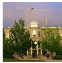
Changes to Election Laws from the 2021 Legislative Session