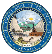
State of Nevada Mail Ballot Preference Form