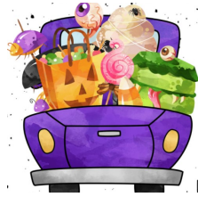
Trunk-or-Treat Was a Success!